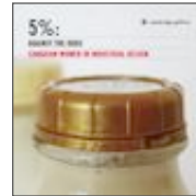
5%: Against the Odds, Canadian Women in Industrial Design Esther E. Shipman

58 pp 24 col. ill. 8 x 12 in softcover 978-1-926589-13-8 $20.00 Can. $23.00 U.S. 2012